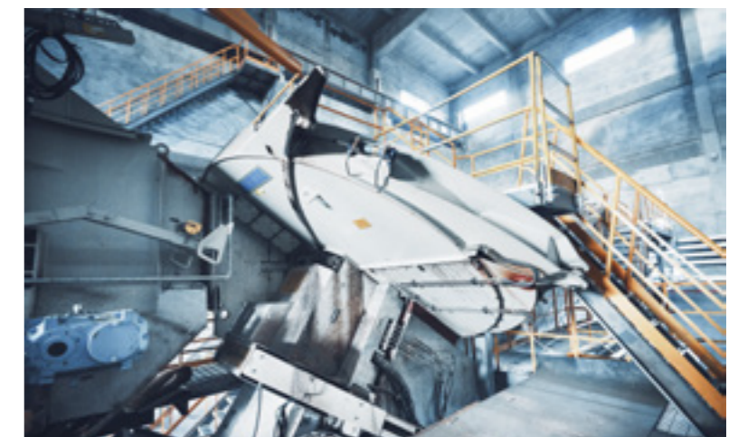
The horizontally fed HHQ-Chipper has a unique chipping geometry that enables it to produce superior quality chips at the highest production throughput.