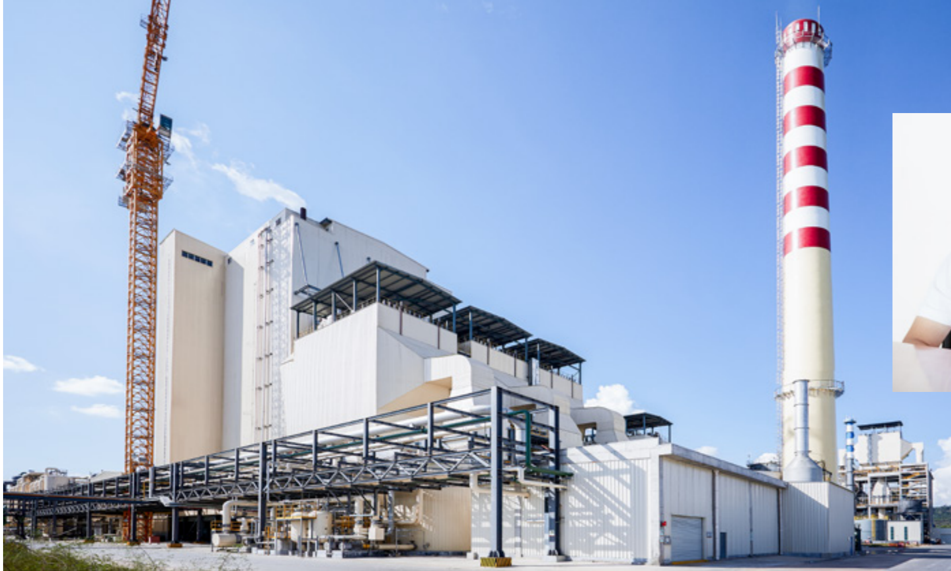
ANDRITZ supplied the mill with the largest HERB recovery boiler in Laos with a capacity of 2,200 tds/d, in order to secure safe and reliable operation.

"The major challenges associated with the project were mostly to do with the weather," says Liang Hongjin. "It can rain really hard here making the roads virtually impassable due to floods and mud. All the equipment for the project had to come in via road from ports in Vietnam but, although there were a few scheduling problems, we overcame the hitches without too many problems."